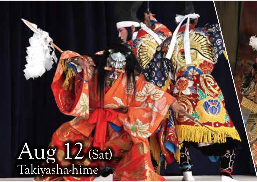
Aug 12 (Sat) Takiyasha-hime