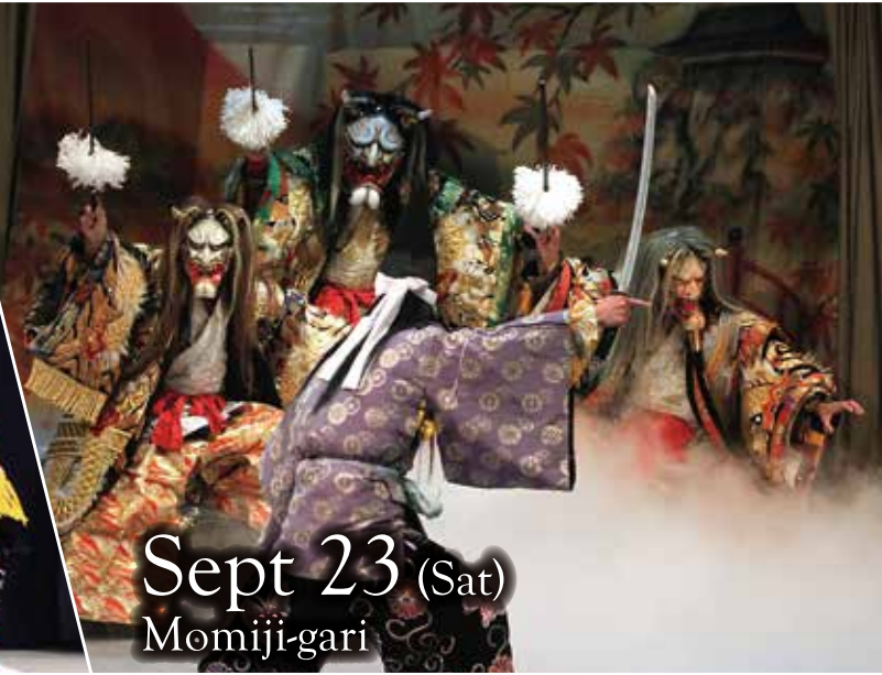
Sept 23 (Sat) Momiji-gari