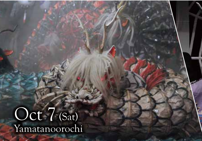
Oct 7 (Sat) Yamatanoorochi