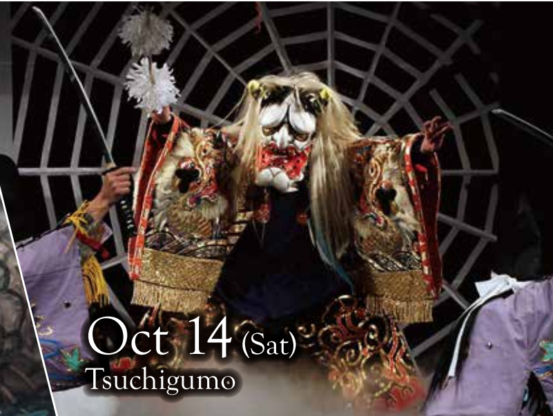
Oct 14 (Sat) Tsuchigumo