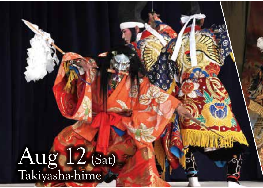
Aug 12 (Sat) Takiyasha-hime