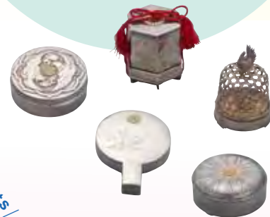
Bonbonnières, Showa period (1926-1989)