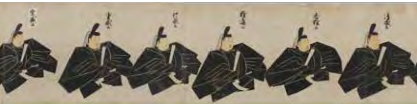
Goshin, Portraits of the Emperors and Regents , Scroll of Grand Ministers, Kamakura and Nanbokucho periods (1185-1392), 14th century [Second period]