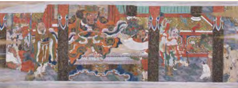
Iwasa Matabei (1578-1650), The Tale of Oguri Hangan , Scroll 10, Edo period (1615-1868), 17th century [Second period]