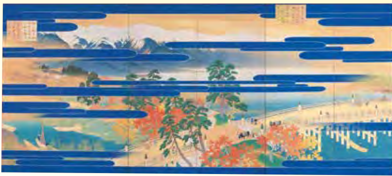
Kawai Gyokudo (1873-1957), Poetry and Genre Scenes from Yuki Province for Daijōsai (Grand Thanksgiving Festival following Enthronement) of Emperor Showa, Left screen 1928 [First period]